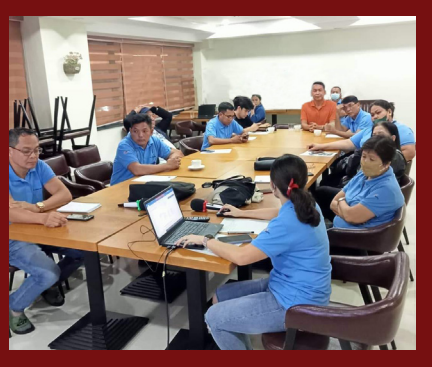
SCPC-SLPGC MMT Team conduct Q4 Results Validation