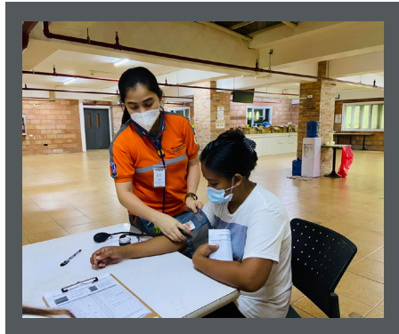
SCPC & SLPGC reaffirm medical support to host community